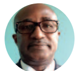
Insa Bamba Africa, Ivory Coast